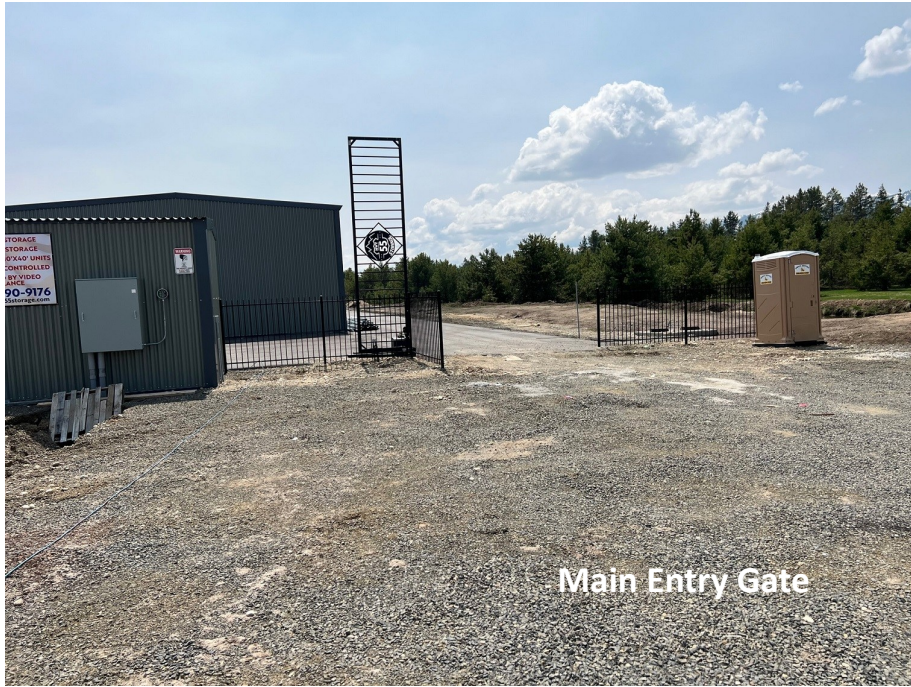
Main Entry Gate