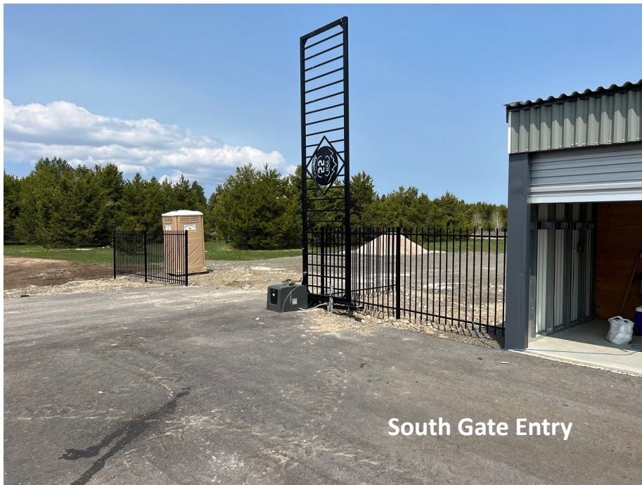
South Gate Entry