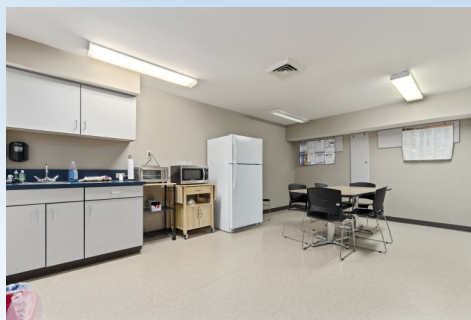
Lower Level Kitchen