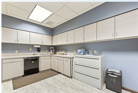
Main Level Kitchen