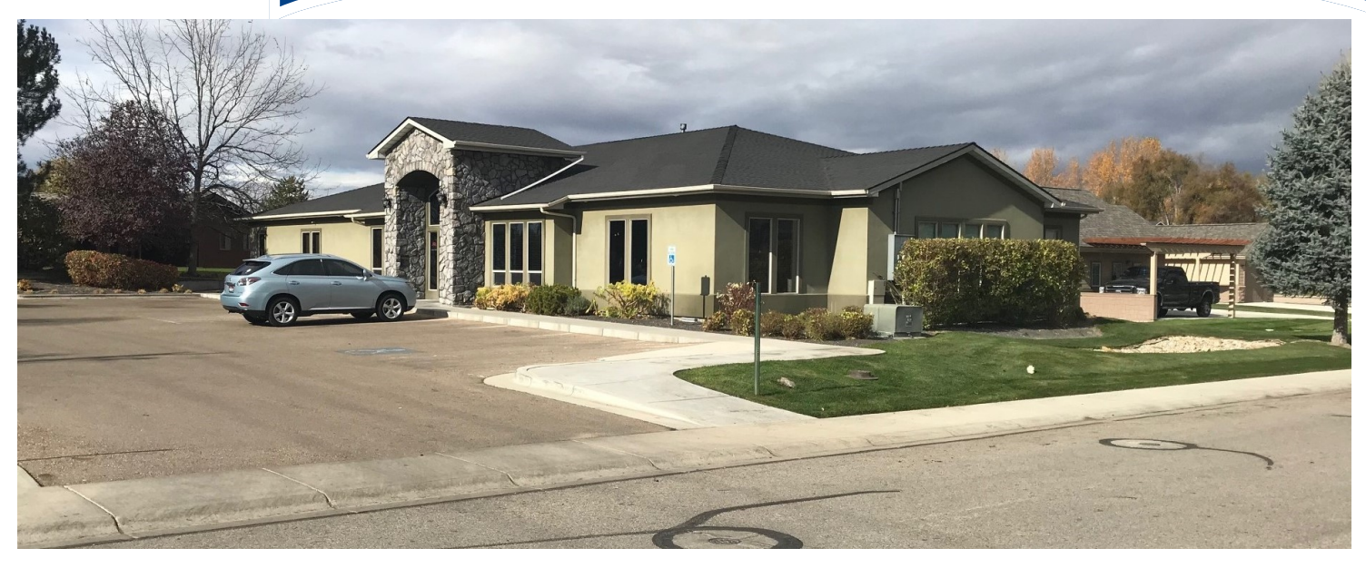
2,150 SF Office Space for Lease $13.95 / Square Foot